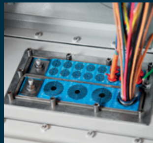
Safety control cabinet