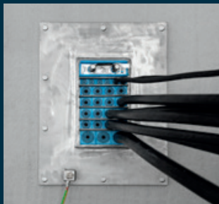
LV/MV power cables

Roxtec sealing solutions are ideal when multiple cables and pipes of different types and sizes enter walls, floors, or underground. They secure protection by maintaining barriers and separation of key functions such as power supply, emergency back-up power, monitoring, control, pumping, cooling, and turbine and generation activities. The seals meet international safety ratings and withstand harsh environments. Use our seals to simplify design, save space and manage high cable density. You can maintain the safety level at very high fill ratio and benefit from instant performance as there is no need for drying or curing.