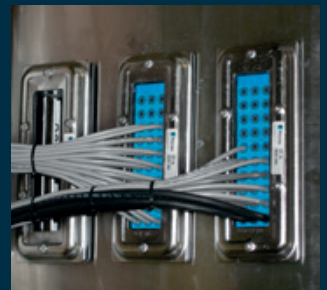
Process control and instrumentation