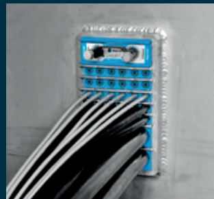
Control and instrumentation