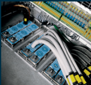
UPS Cabinet – uninterruptible power supply

Roxtec cable entry seals are ideal as standard solution for all cabinet and enclosure applications. You can even route cables with connectors to save time and avoid the risk of error. Make sure you have EMC solutions to protect sensitive equipment as cable pass-throughs often are vulnerable areas when it comes to EMI.